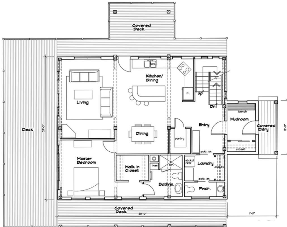
Main Level Floor Plan