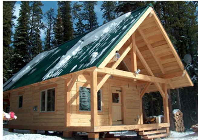
Designed by: Zirnhelt Timber Frames

This 18 x 22 cabin is perfect for weekends at the lake or as a guest house on your property. By putting the sleeping quarters in the loft, the main floor can be left open.